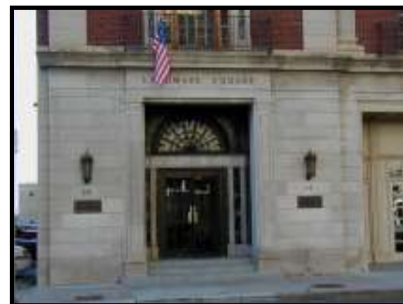
Landmark Square Building

We are located just north of the corner of Market & 1st Street in Wichita